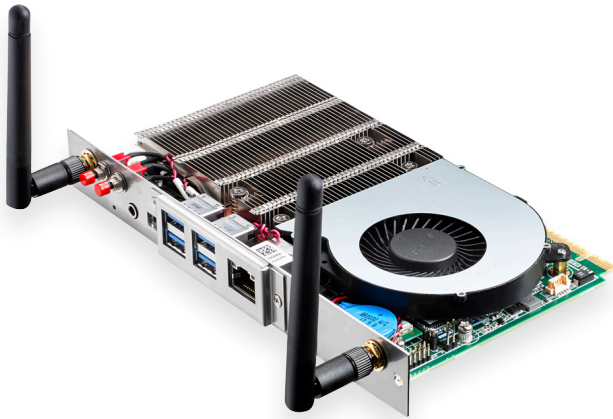
Intel® Smart Display Module Large (Intel® SDM-L)

“Advantech is working closely with Intel to develop a new generation of modular digital signage solutions and DS-200 is the first one based on the Intel® Smart Display Module architecture. We hope to combine high display computing capabilities and integrated display modules to deliver a new age of digital signage experiences in visual IoT applications, as well as empower multiple vertical markets such as retail, medical and more.”