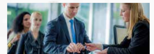
Banks and financial institutions