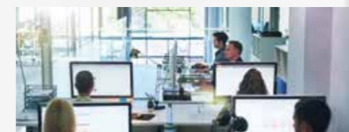
Small and medium-sized offices, along with enterprise environments