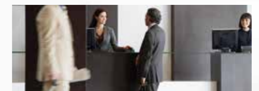
Hospitality, including hotels